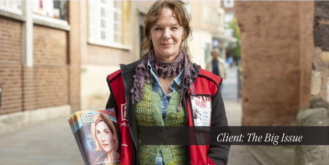
Client: The Big Issue