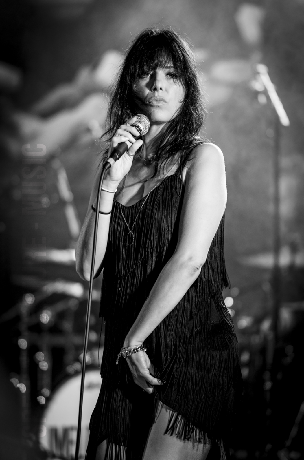
Imelda May and The Luck at Chagstock Music Festival in Devon